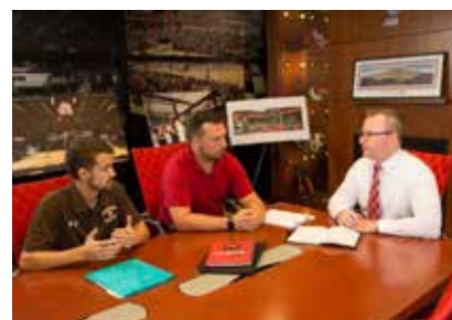
University of Cincinnati's sports masters focuses students' attention on futures in intercollegiate and interscholastics.

University of Cincinnati takes a holistic approach to sports management education. Courses develop proficiency in key business areas, such as marketing, finance, facilities operations, revenue generation and management strategies, yet remains tailored to the challenges of working in intercollegiate and interscholastic sports with offerings in topics such as