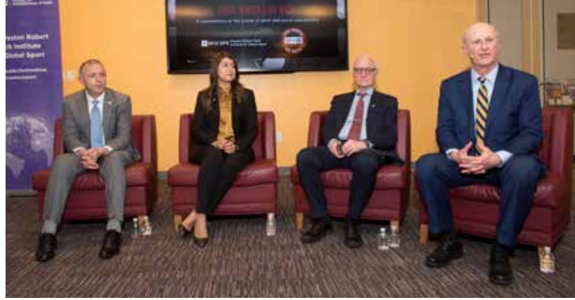
In addition to its high-profile conferences, cutting-edge education and industry knowledge, NYU's Tisch Institute for Global Sport has a new degree for Fall 2019 — a master of science in Global Sport — to answer an industry need in an increasingly global sports marketplace.

"Sports business is increasingly a global phenomenon," Gennaro said.