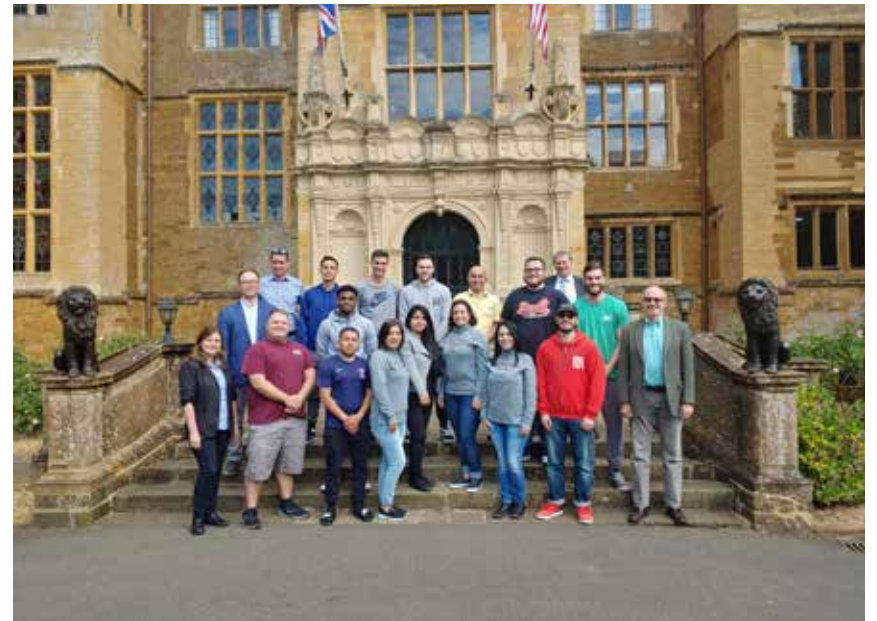
Fairleigh Dickinson graduate students take an annual trip to the school's Wroxton College in England, for an intense week of hands-on learning, tours and networking with industry experts.

The curriculum, which earns students a bachelor's and a master's in Sports Administration simultaneously, has rapidly become as popular as the school's on-campus and