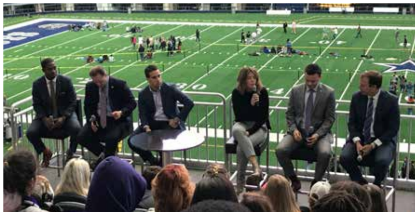
UNT brought together Dallas Cowboys executives for an industry panel for DECA High School Day at AT&T Stadium.