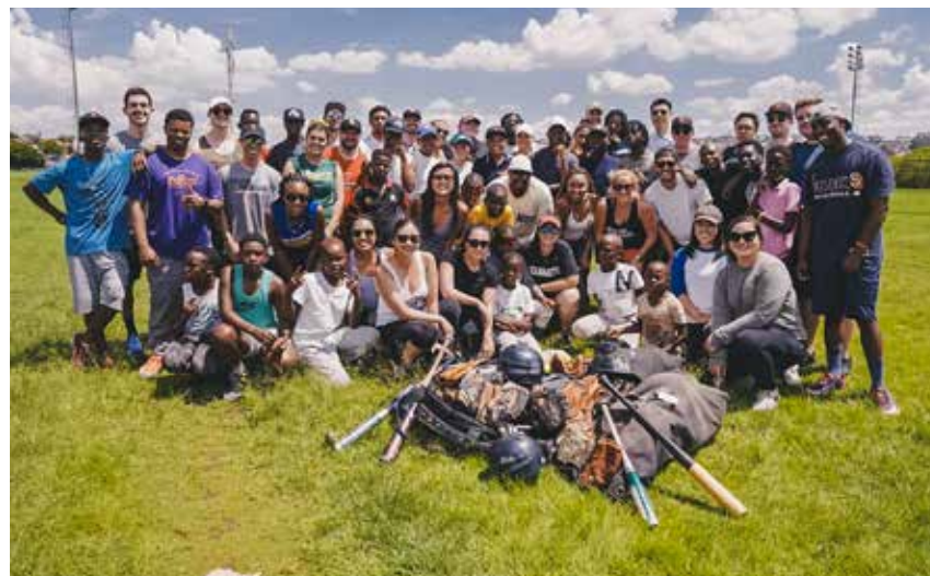
USF Sport Management offers the course, Global Sport Management Immersion in South Africa. During their study abroad, USF Sport Management students spent time with young athletes of the Alexandra Baseball Club. Our students worked with the Baseball Without Borders Foundation to provide much-needed equipment and apparel to the team.