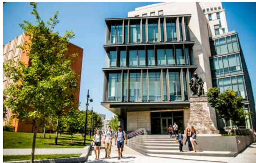
At its beautiful campus in Philadelphia, Drexel University offers an array of options for earning a sports masters, from full-time to part-time, and from a master of science in sport management to an MBA with a sport minor, to give working professionals flexibility.

Women in Sports Conference in February, he said. By exploring the perspectives of recent women graduates beginning their careers, as well as executives working in high-powered positions within the industry, the conference took a hopeful look at the future of sport, highlighting the importance of inclusive work environments and encouraging young women to make bold career moves.