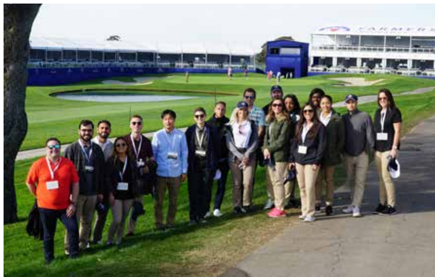
San Diego State University's Sports MBA has a well-deserved reputation for selecting highly motivated students and delivering a forward-looking curriculum. SDSU graduates go on to become industry leaders.